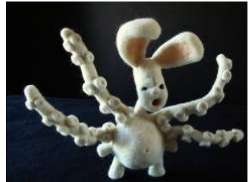
Tobiah Mundt Octobunny , 2008 Wool, wire 12" x 12"