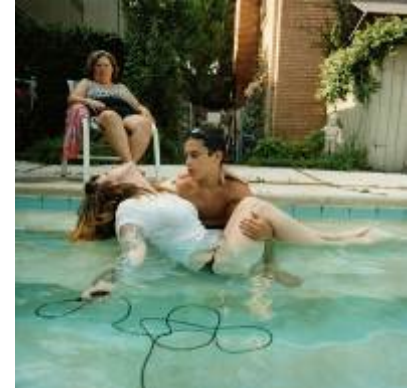
Emily Peacock Pieta # 3 , 2012 20" x 20" Archival Inkjet Print

Present Tense brings together the work of six artists using sculpture, video and photography to explore personal narratives that vary in topics from gathering resources from loved ones and managing the physical residue of past relationships to questioning luxury driven consumerism. The works rely on the shared vocabulary of gender and together express moments of confusion and clarity as the artists navigate the balance between the seemingly concrete yet rapidly shifting position of their assumed societal roles. Present Tense will feature new works by Shannon Duncan, Rosine Kouamen, Emily Peacock, Britt Ragsdale, Arnea Williams and Sapphire Williams.