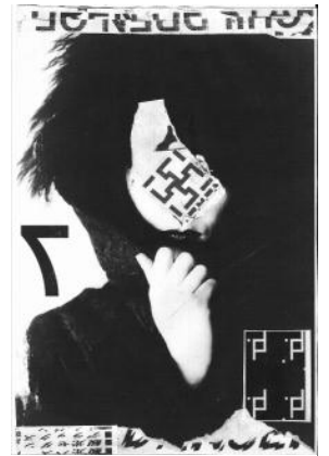
DOMOKOS / FUTURE BLONDES 0.0.0.0.

Patrick Turk's highly detailed collages not only use images of the body, or body parts, but are meant to excite a physiological experience for the viewer. Turk is a story teller who uses psychedelic movements and intricate designs to captivate the viewer and bring them into an exotic reality where the body becomes more than it seems. The work produced during the Lawndale Artist Studio Program is a glimpse into Earth's future as The Superorganism , in which the planet's surface becomes one gigantic, interconnected biomass comprised of all of the flora and fauna on Earth. The integration is both biological and telepathic creating a planetary network in which the whole truly is comprised by the sum of its parts. This transformation begins as a last ditch effort to save humanity, reduced by plague, from imminent extinction.