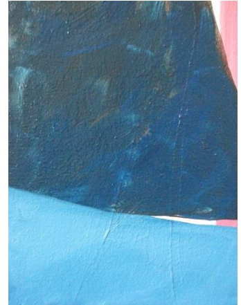
Jessica Ninci Little Lies , 2013 Oil on canvas 8" x 6"