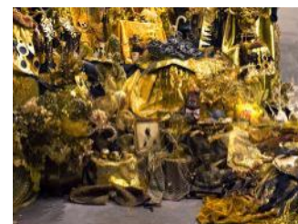
Anthony Sonnenberg All That Glitters (detail), 2012 Taxidermy, ceramic, glass, found objects and fabric Dimensions variable