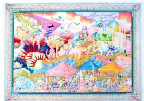
Christopher Wallace DinoLand, 2016 Pen and ink on paper 38" x 50"