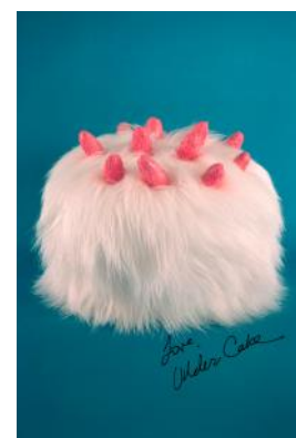
Cobra McVey Udder Cake , 2016 Magazine page 11" x 8.5"

1 (Detail), 2016 Plaster, cement, wax, resin, foam, glass, paper and rebar Dimensions variable