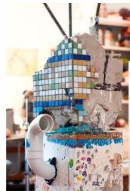
Bradly Brown Column

1 (Detail), 2016 Plaster, cement, wax, resin, foam, glass, paper and rebar Dimensions variable